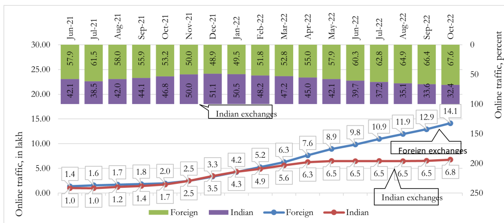
Figure 2: Online Traffic from India into Foreign and Domestic Centralised VDA Exchanges

Figure 2/ Table 4 shows the smoothed online traffic from India to foreign and domestic centralised VDA exchanges, at a monthly frequency. Starting Feb 2022, there is clear evidence of foreign centralised VDA exchanges gaining traction, at the cost of Indian centralised VDA exchanges. That is, there is robust evidence that many Indian investors switched (approximately 17 lakhs if share of Indian users on Indian exchange remain as before Feb 2022), as a result of the domestic VDA tax architecture. Using an alternate data on VDA adoption rate, proxied by number of app installs of domestic centralised VDA exchanges by Indians, we notice a month-on-month fall of 16 percent during Jul-Sep 2022, while downloads of foreign counterparts increased by a commensurate amount (source: Appannie, n.d. ).