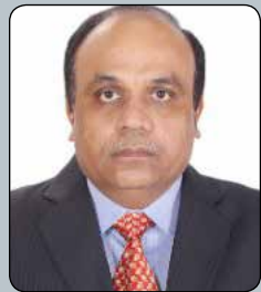
Upender Gupta (Commissioner, GST)